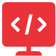
Strong Technical Foundation