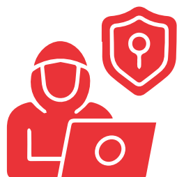
Ethical Computing Practices