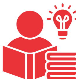
Lifelong Learning Mindset